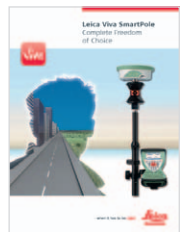
Leica Viva SmartPole Product brochure