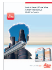
Leica SmartWorx Viva Product brochure