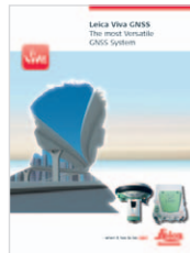
Leica Viva GNSS Product brochure