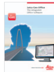
Leica Viva LGO Product brochure