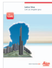
Leica Viva Overview brochure

Illustrations, descriptions and technical data are not binding. All rights reserved. Printed in Switzerland – Copyright Leica Geosystems AG, Heerbrugg, Switzerland, 2012. 774100en – VIII.13 – galledia